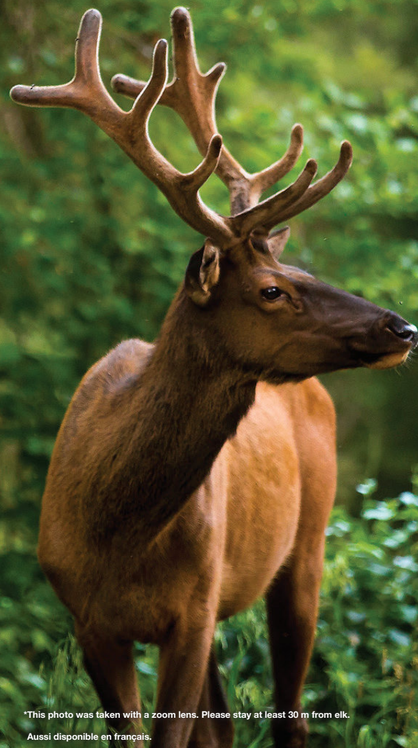
*This photo was taken with a zoom lens. Please stay at least 30 m from elk. Aussi disponible en français.